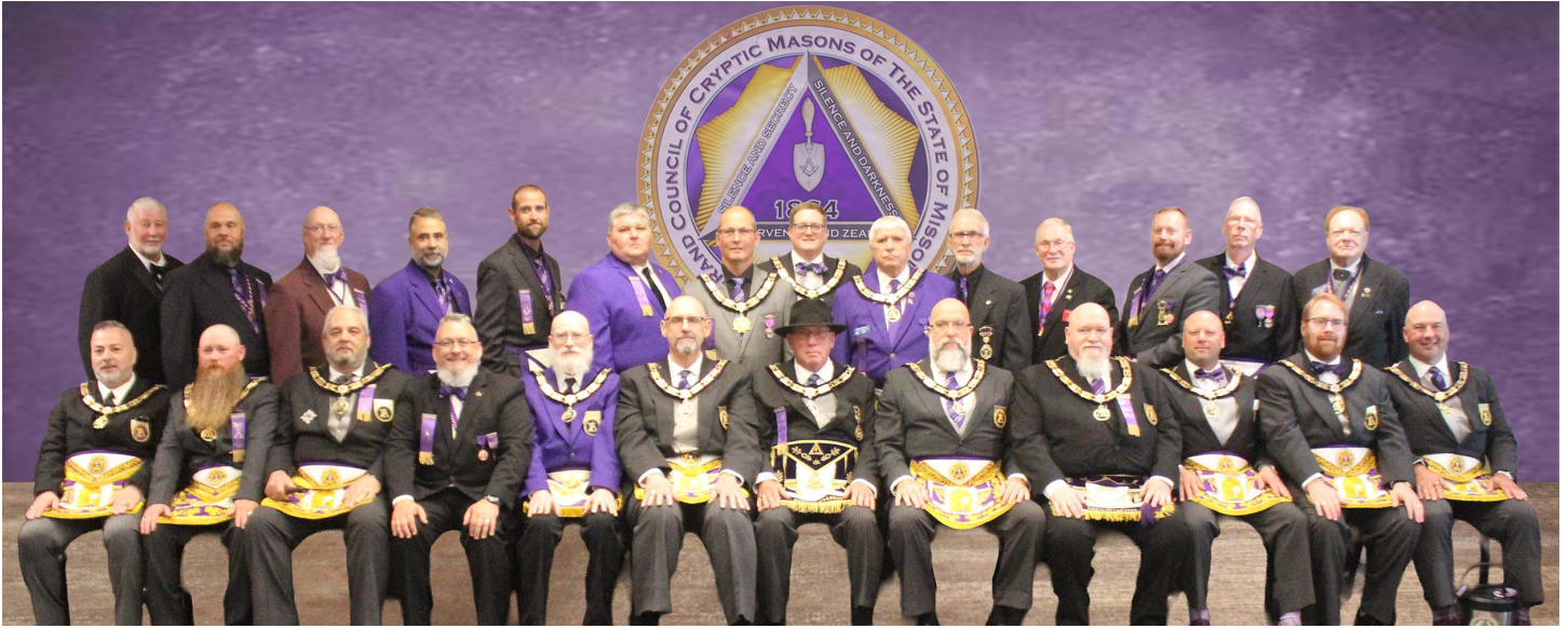
2025-2026 Grand Council Officers